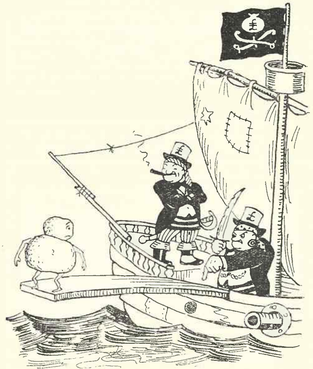
The simplest solution of the surplus, says "The Times," is to sink it in the sea.

That is an easy one. We destroy food as a Solution. For example, the Paris correspondent of The Times , speaking of the French wheat surplus, says, "the simplest solution would be to buy the wheat and sink it 50 miles out to sea." Now, if Nature had drowned the wheat with a flood it wouldn't solve anything. It would simply be an act of God, which, as any theologian will tell you, has