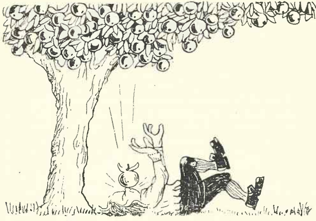
Newton discovered the danger of a fruit surplus, and called it Gravity.

Our rulers and economists lose no opportunity of discouraging this unpatriotic and Budget unbalancing habit, and daily the newspapers ram the lesson home. It is not that we should abolish food as such. The purpose of this propaganda is to discourage the popular notion that the purpose of food is to be eaten. It is not. The purpose of